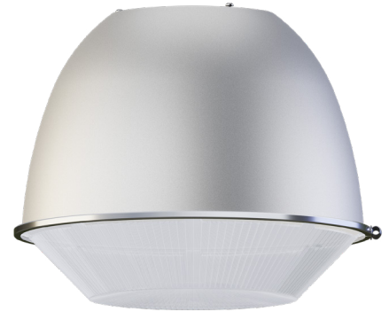
16" Reflector + 16" Drop Lens (Reflector not included)