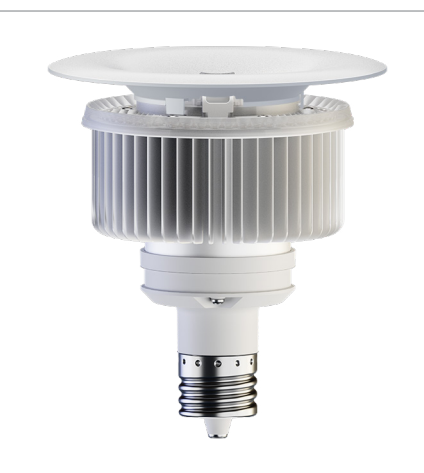
VA6 Lamp + 5" Post Top Reflector (Lamp not included)